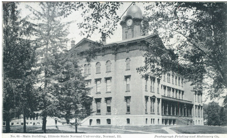
No. 61—Main Building, Illinois State Normal University, Normal, Ill.